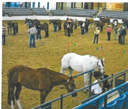
The EDCC will provide accurate information and real-time alerts when disease outbreaks occur.

Organizers have established a communication protocol to coordinate all those who are involved with providing disease outbreak information. Working in cooperation with state animal health officials and the USDA, the EDCC will seek information about current disease outbreaks by reviewing official state and federal reports, along with reports from news media, social media, and veterinary practitioners. In addition, representatives